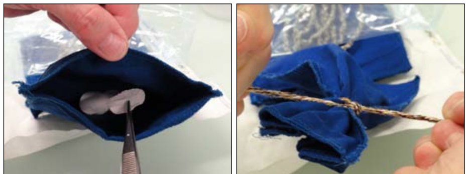
Fig. 1: Per test germ, 5 biomonitors are transferred into a blue cotton bag. The cotton bag is sealed.