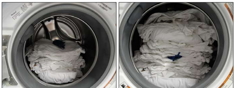
Fig. 2: The cotton bags are placed in the middle of the load without touching each other